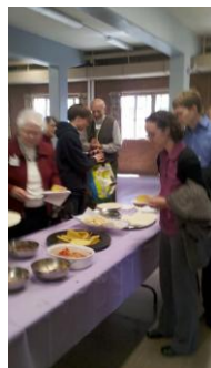
The yummy "Good Meal" prepared by the youth with proceeds going to Japan disaster relief.

May 22- Congregational Picnic & games for young people (sack race, egg toss, and others...) 11:00 AM