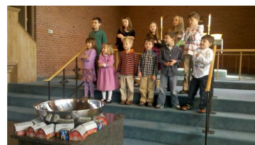
Sunday School children sing during worship on March 27.